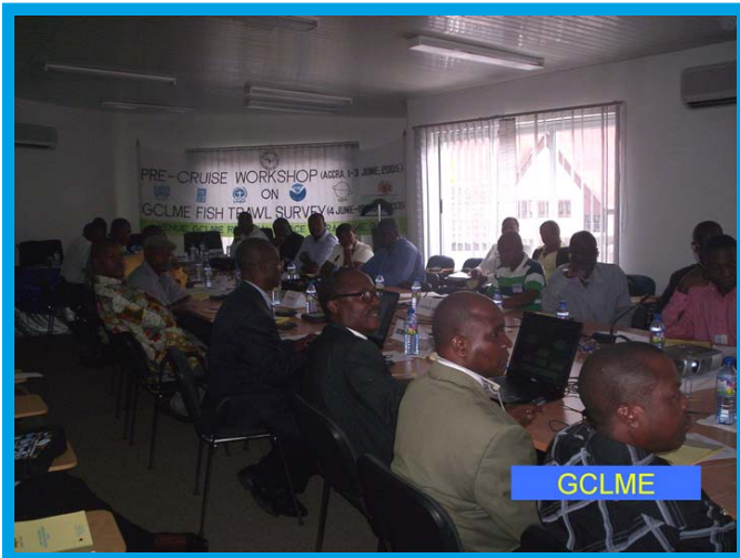
A Cross-Section of Participants at the Opening Ceremony