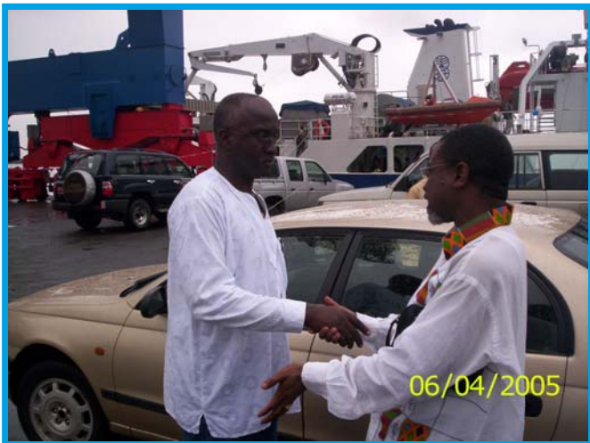
The Regional Director seeing off the Deputy Minister at the end of the Flag off Ceremony.