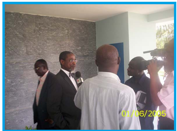
The Regional Director, GCLME, Briefing the Press following the Opening Ceremony.