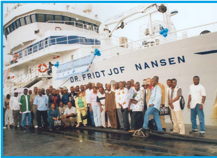
The Participants set for a group photograph in front of the RV Dr. Fridtjof Nansen